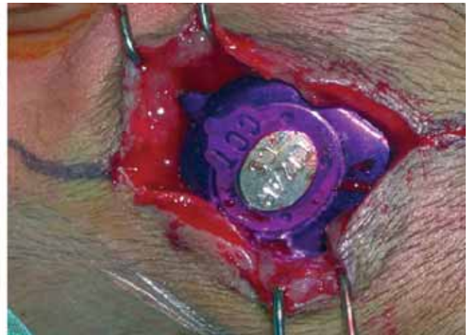
Figure. A, Severely pruriginous erythema with serous discharge ( 2 \times 1 \text{ cm}^2 ) over the central area of the skin flap. It appeared 16 days after implantation and persisted for 3 months. B, Immediate intraoperative finding during the removal procedure. The processor was exposed without its normal fibrous capsule and surrounded by gelatinous material.